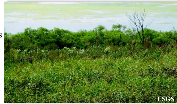
Shrubs along marsh edge

The Shallow Marsh Shrub Habitat represents areas near the shoreline or around lakes, ponds, and backwaters that are >25% vegetated with seasonally flooded shrubby vegetation. It typically grows with mixed emergents, grasses, and forbs. This general class tends to be drier than deep marsh shrubs, but wetter than wet meadow shrubs. Willows ( Salix ) are the predominant shrub type. Other indicator species are Dogwood ( Cornus ), False Indigo ( Amorpha ), and Swamp Privet ( Foresteria ). Shallow marsh shrubs are typically found growing on soils that are saturated or inundated with little water.