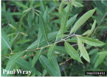
Willow Salix spp.