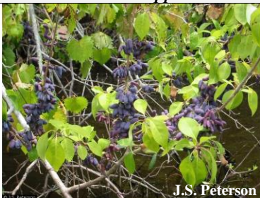
Swamp Privet Foresteria spp.