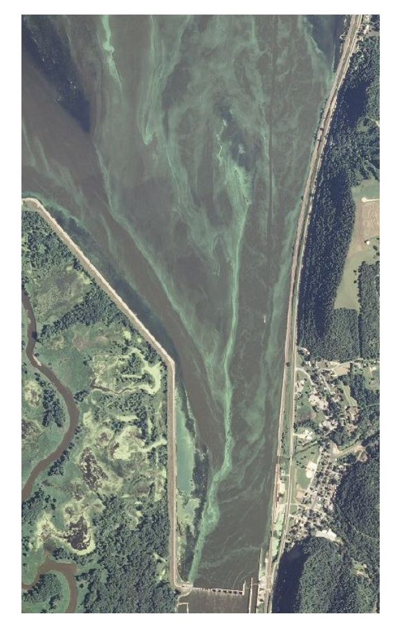
Aerial photo of UMR Pool 8, with streaks of blue-green algae visible.