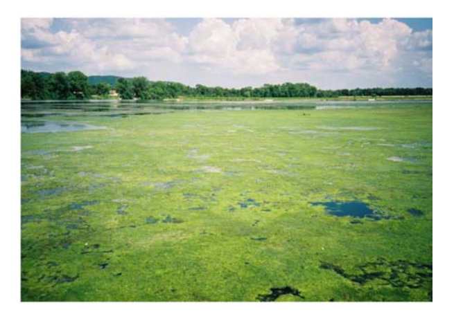
Filamentous algae growth in Spring Lake, Upper Mississippi River Pool 5.