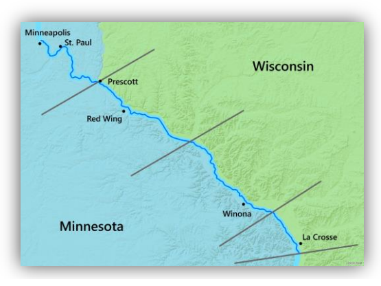
Location of UMR CWA Field Pilot Monitoring Project (Wisconsin-Minnesota Shared Reaches)